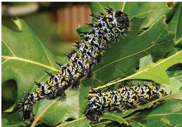
A late instar caterpillar feeding on a Mopane tree.