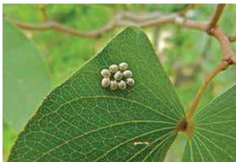
A hatched or parasitized egg cluster on a Mopane leaf.

Gregarious first instar caterpillars feeding on a Mopane leaf – the first three instars are always gregarious, while the fourth and fifth are always solitary, a strategy which regulates their physiological constraint.