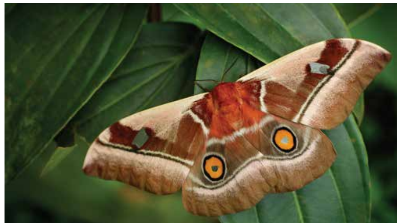
The short-lived emperor moth is the final stage. The un-feathered antennae seen here indicates a female.